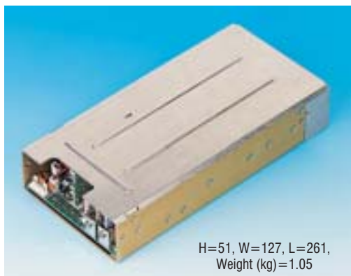
H=51, W=127, L=261, Weight (kg)=1.05